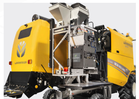
Powerful weighing system Twin H2 from HarvestMaster, with precise weighing, moisture and volume weight data