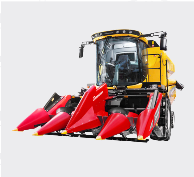
Precise center separation from the header to the sieve